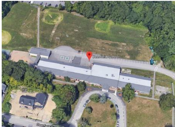
Deerfield Elementary School - 1953