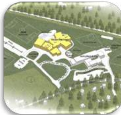
Medfield Dale ES