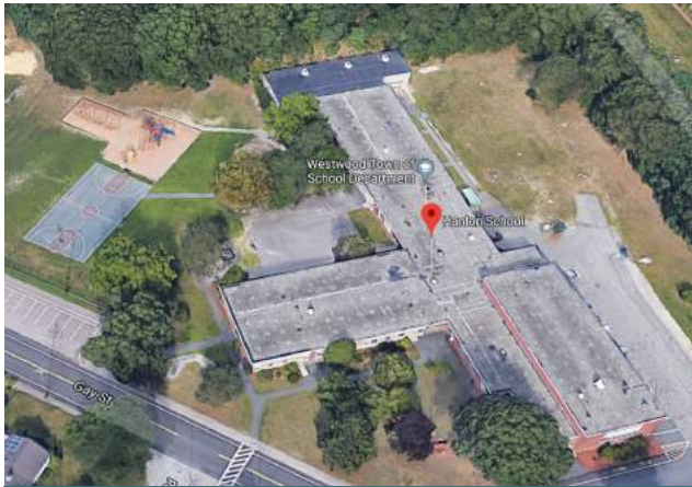
Hanlon Elementary School - 1951