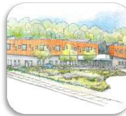
Westborough Fales ES