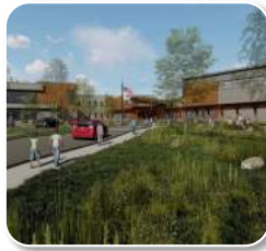
Westwood Hanlon-Deerfield ES