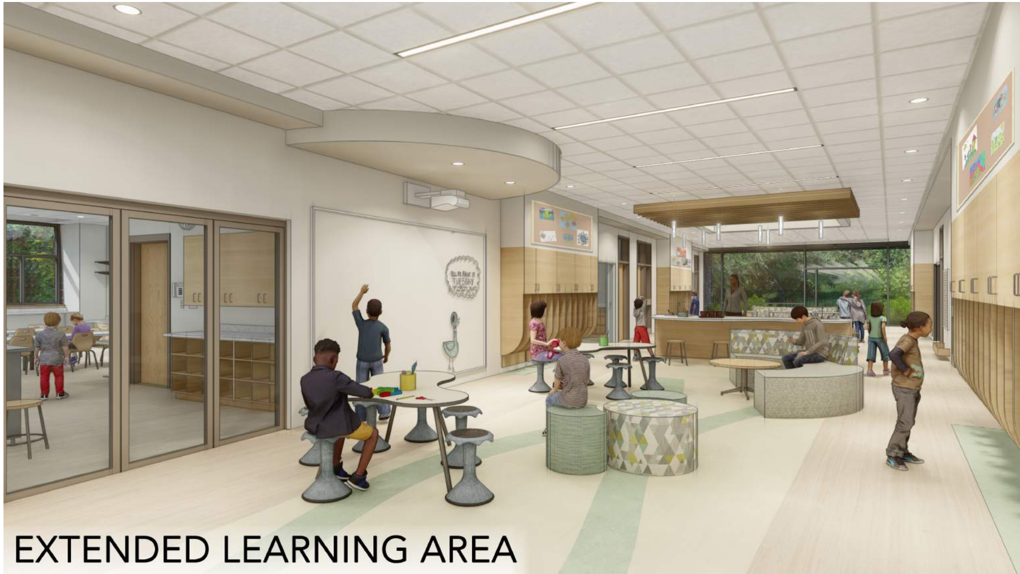
EXTENDED LEARNING AREA