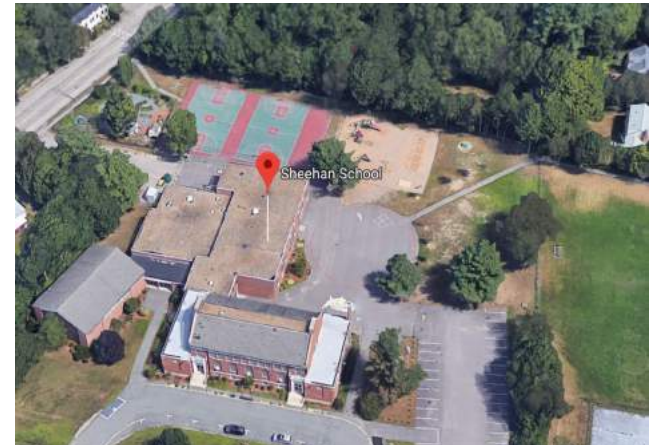
Sheehan Elementary School - 1948