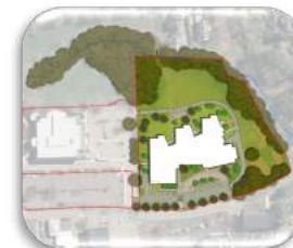
Wellesley Hardy ES