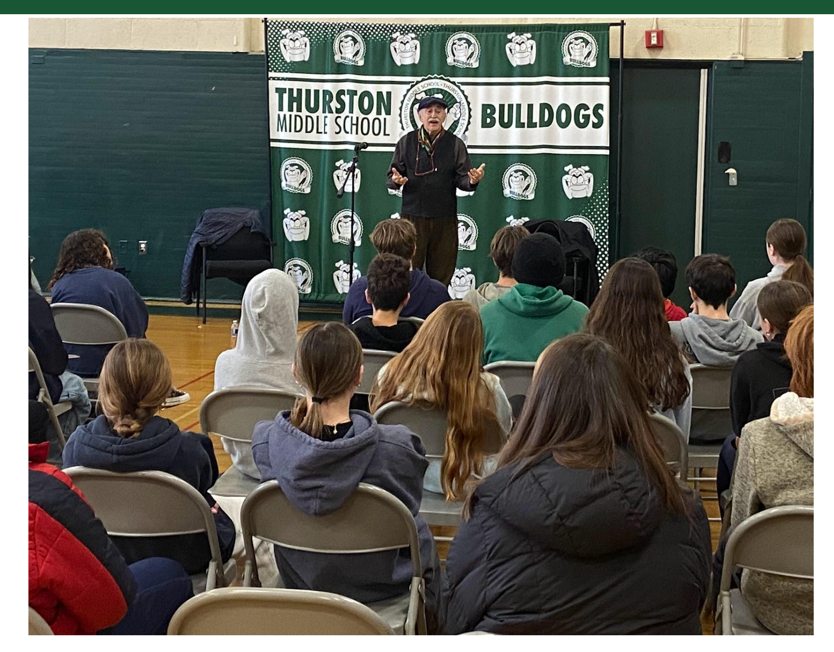
reflection and discussion.