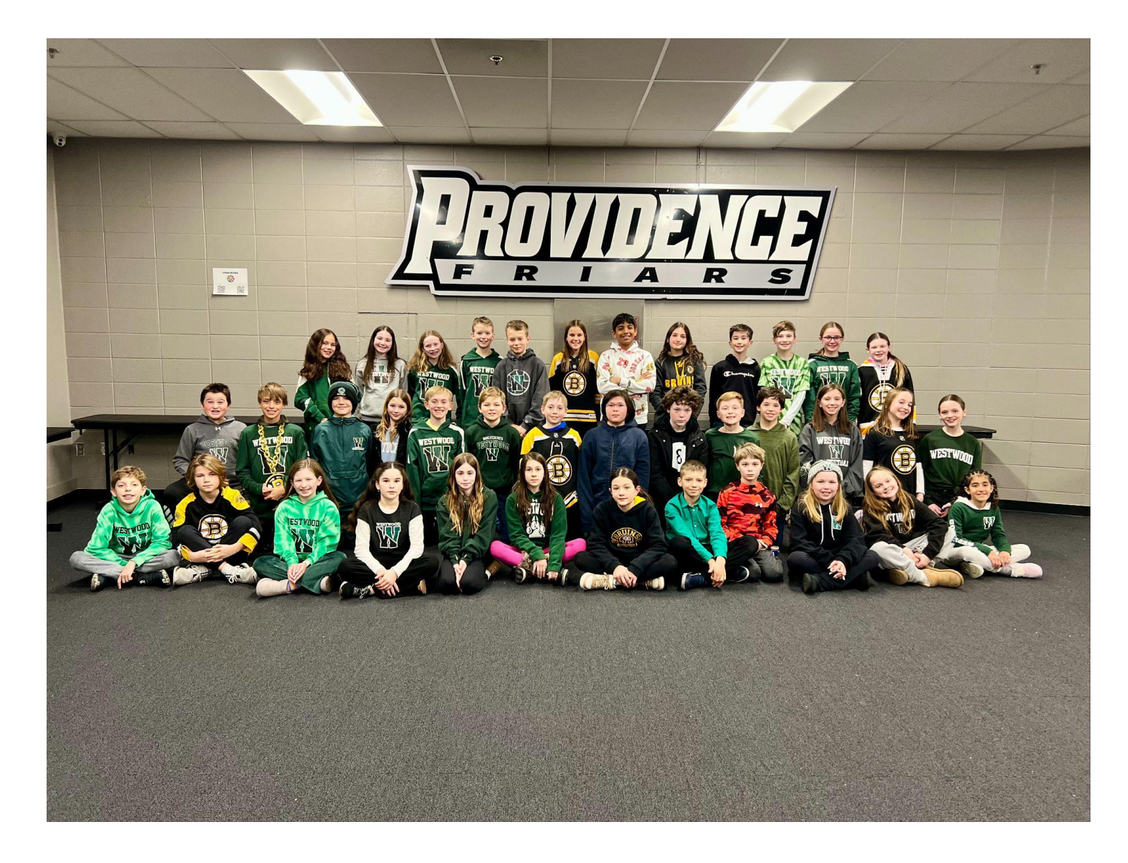
38 fifth graders from Pine Hill performed "America. the Beautiful" at the Providence Bruins game