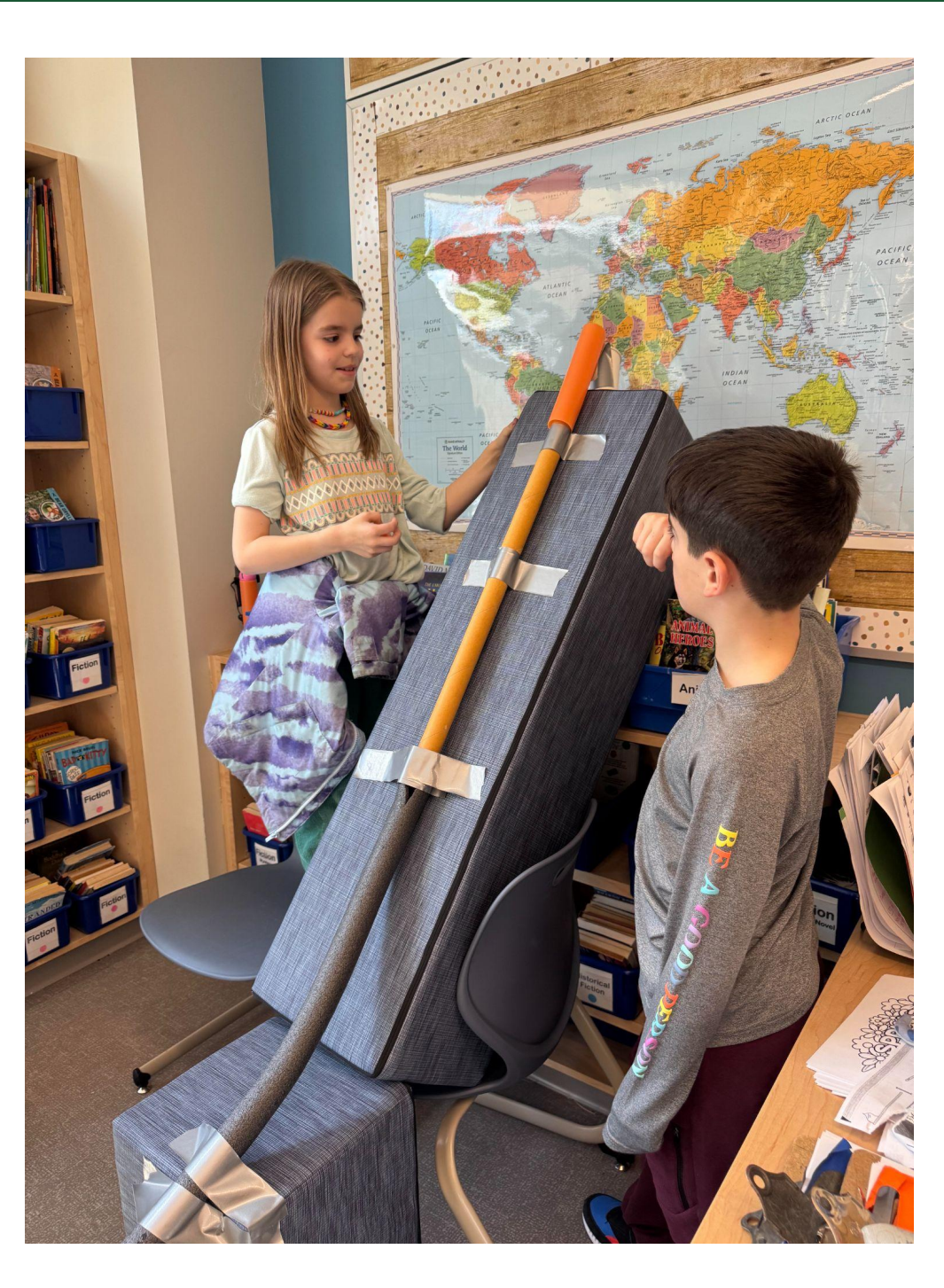
Students at Pine Hill making Rube Goldberg projects