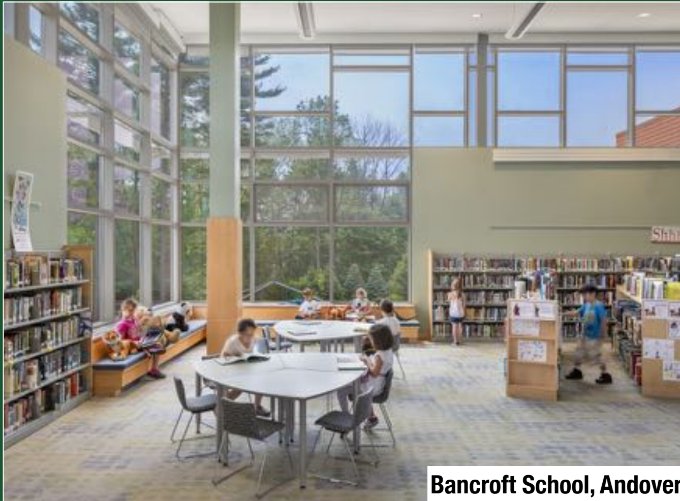
Bancroft School, Andover