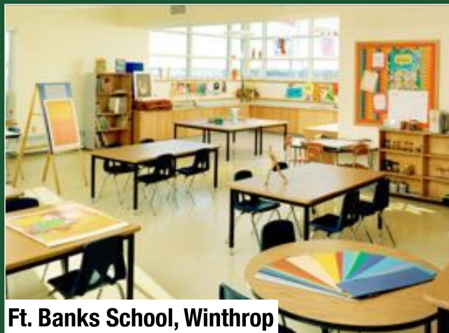
Ft. Banks School, Winthrop