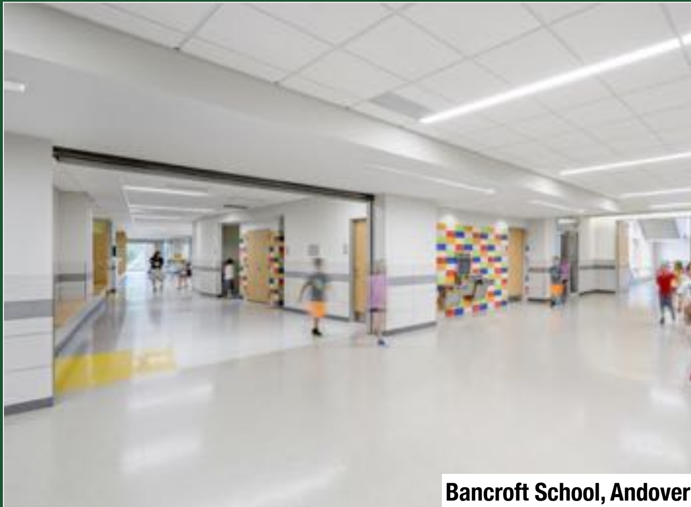
Bancroft School, Andover