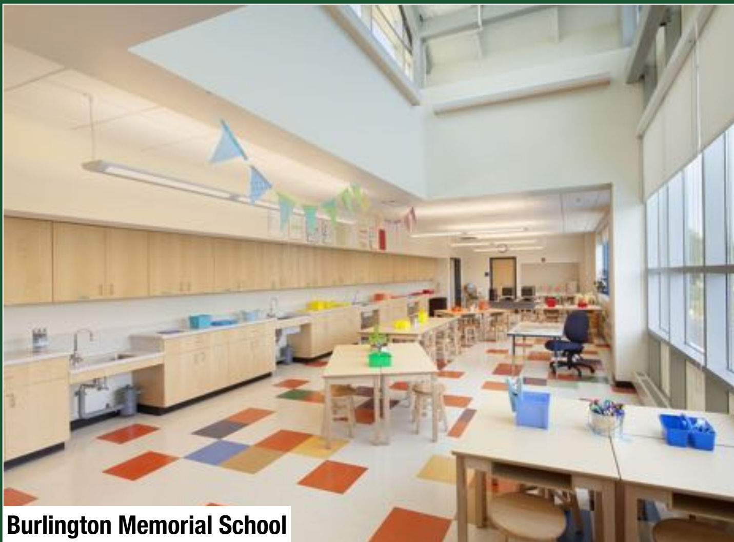
Burlington Memorial School