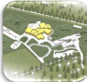
Medfield Dale ES