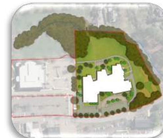
Wellesley Hardy ES