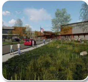
Westwood Hanlon-Deerfield ES