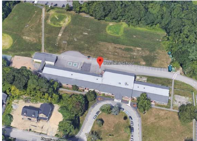
Deerfield Elementary School - 1953