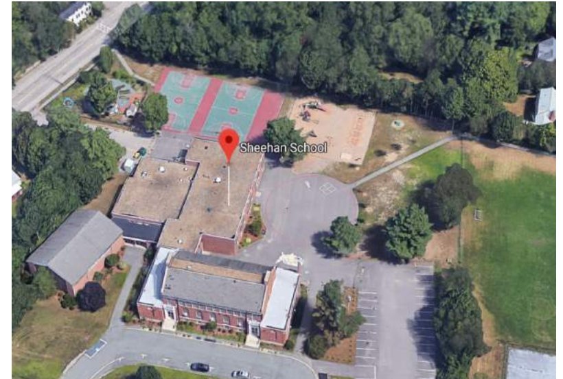
Sheehan Elementary School - 1948