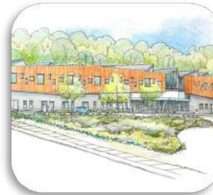
Westborough Fales ES