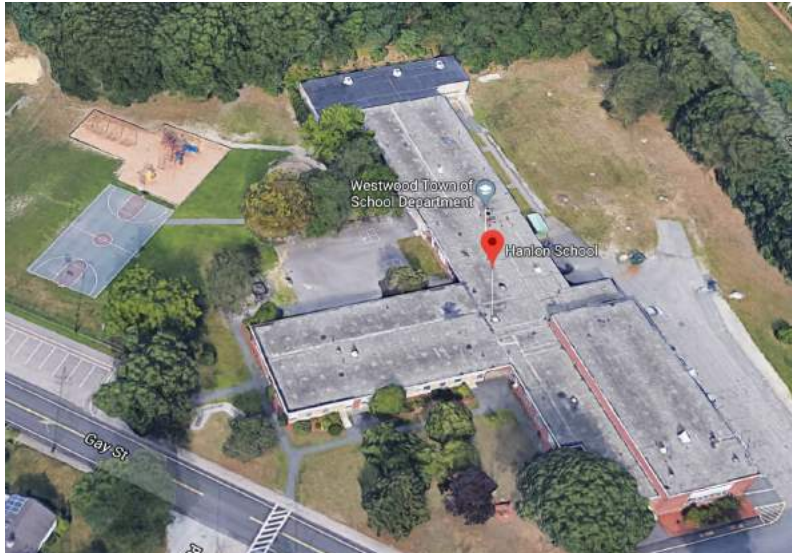
Hanlon Elementary School - 1951