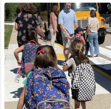
Kindergarten taking the bus! How grown up!