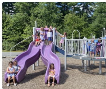
Kindergarten Popsicle Party!